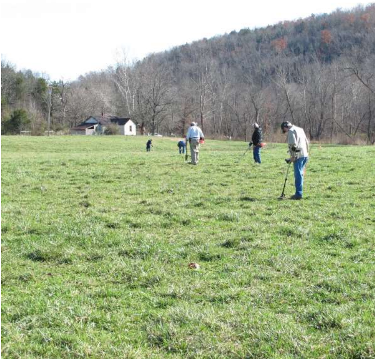
Figure 4. The metal detector team making a sweep of the inventory area.

or, as necessary, oriented by topographic feature orientation. Detector operators proceeded in line, using a sweeping motion to examine the ground.