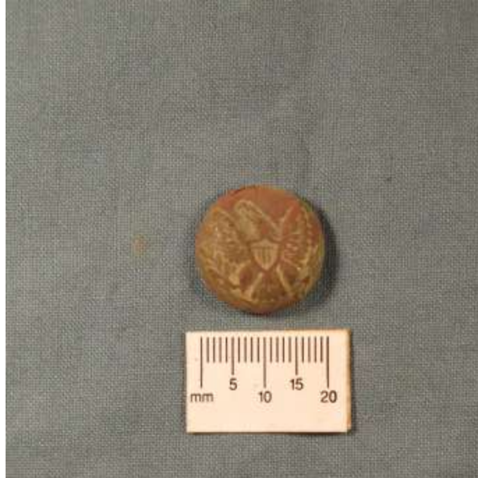
Figure 8. General Service coat button.

One iron utensil shaft fragment was collected (FS3). It is a piece of an iron shank of a fork or spoon. The remaining length is about 2 inches. Two fragments of pocket knives were collected. One pocket knife (FS17) is a two bladed pocket knife with wood handles or slabs and an iron bolster. The handles are mounted with brass pins. The knife fragment has an overall length of about 2 inches. The second pocket knife fragment (FS16) is a single bladed style with the handles or slabs missing and one iron bolster. Its remaining length is 3 1/2 inches. The blade is closed and broken, but was about 1/2 inch wide. These pocket knives are common styles that date from the mid-nineteenth century to the modern day.