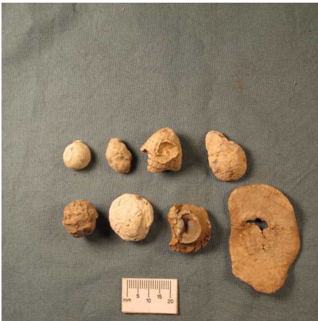
Figure 7. Bullets and lead recovered during the metal detector inventory.