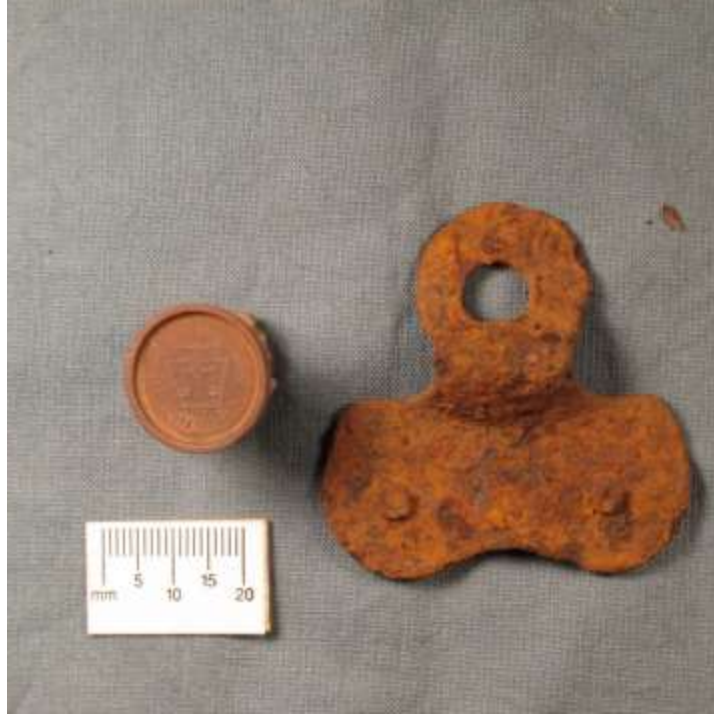
Figure 9. Disston saw medallion and bucket bale ear.