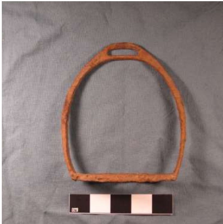
Figure 10. Iron stirrup of a mid-nineteenth century style.