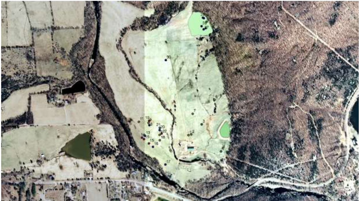
Figure 6. The metal detector inventory area with metal find locations.

The metal detector investigations of the Pilot Knob area yielded only 30 artifacts (Figure 6). Post-battle artifacts that could be definitively identified as such in the field, were not collected during metal detecting efforts.