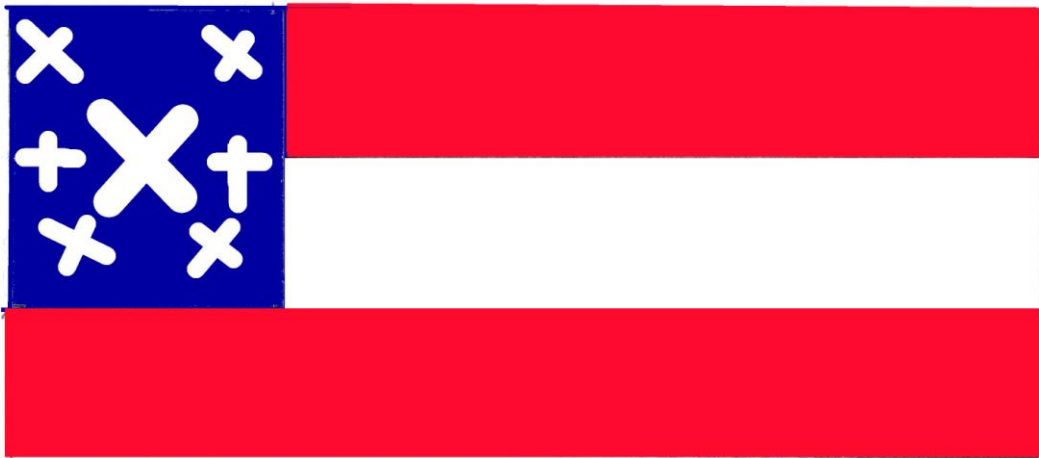
Seven Cross Flag Found On The Battlefield At Fort Davidson