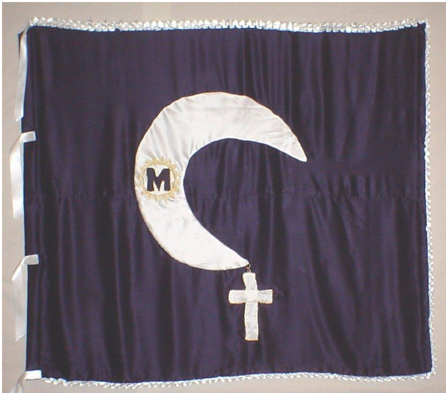
General Marmaduke's Flag